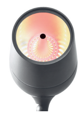
08 The special RGBW optics is based on a circular arrangement of coloured and white LEDs in a rotation-symmetrical, freely-configurable reflector.