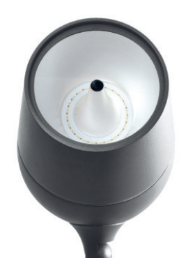
07 Olivio RGBW luminaires enable unlimited colour diversity too. Technically speaking, Selux is breaking new ground here.