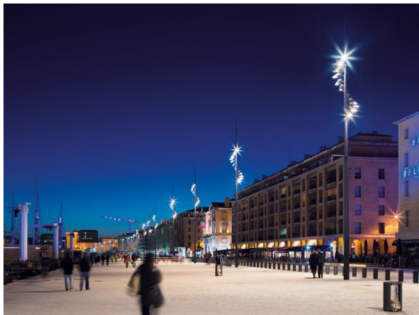
Old Port of Marseilles