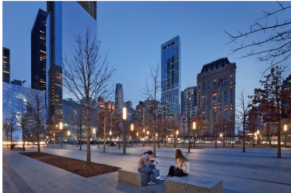
World Trade Center Memorial, New York City